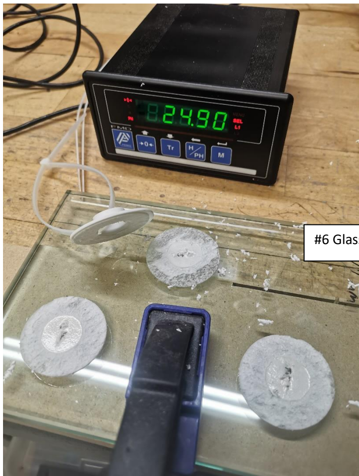
#6 Glass / female pull force = 24,90 kg.