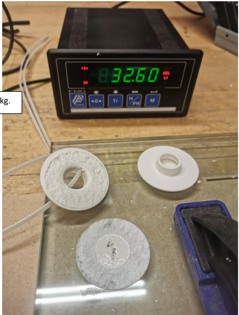
#5 Glass / female pull force = 32,60 kg.